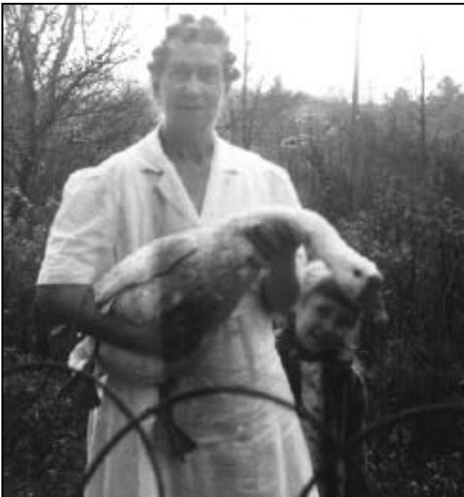
Unknown SWARTZ relation. Photo labeled, "on the way to the slaughterhouse." Poor goose!