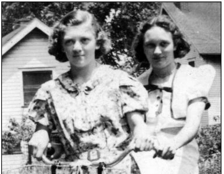
Photo taken around 1936.