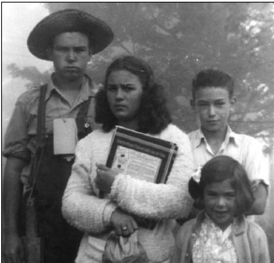
Other SWARTZ family members whose identities are unknown. From Mill City, PA area. Notice that the girl at lower right and boy behind her seem to be same children as in photo at top right of page.